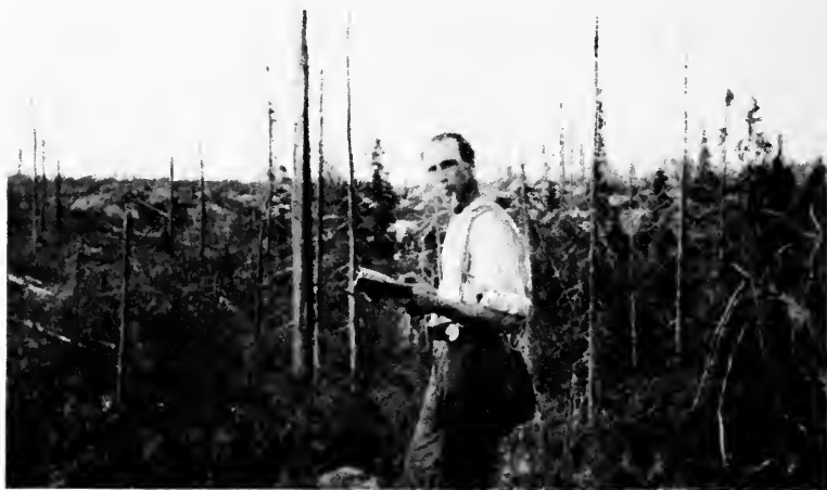
Eight-year old burnt land; the soil was cleaned off.

idle fancy. It needs only the application of figures to project the ratio of depletion into the future with a certainty of showing what a few generations or even a few decades would do toward the serious impairment of the practical supply.