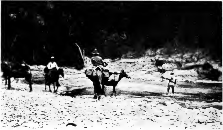
Fording in the South.

If the land requires surveying we first do that. Records and data of the original survey will be obtained, and the old indistinct lines plainly marked on the ground. Lost corners will be found or relocated, and properly set. Careful measurements will be made to ascertain the true acreage, and posts set or trees marked at intervals, usually every quarter mile or half mile, for future reference. Lines of sub-division, according to the wishes of the owner, will be run through the tract, blocking it up into small units of area, as for example the square mile. These lines also will be well and accurately made and marked.