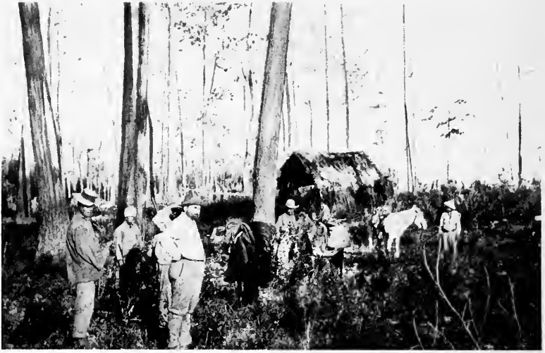
A Southern party. We cover all sections of the American continent.

who knows that exactness is often the difference between failure and success.