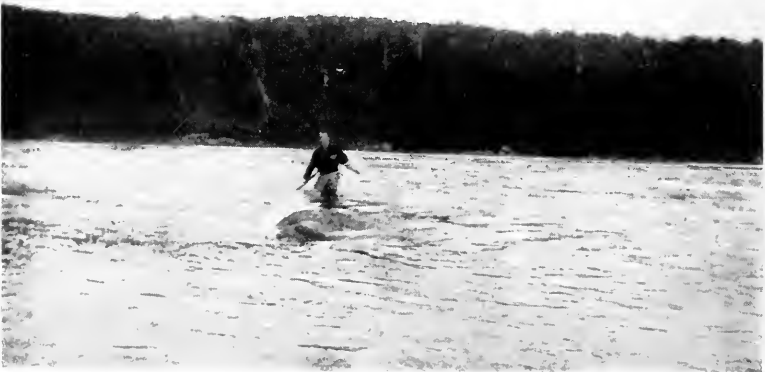
Wading in the North.

If the land requires surveying we first do that. Records and data of the original survey will be obtained, and the old indistinct lines plainly marked on the ground. Lost corners will be found or relocated, and properly set. Careful measurements will be made to ascertain the true acreage, and posts set or trees marked at intervals, usually every quarter mile or half mile, for future reference. Lines of sub-division, according to the wishes of the owner, will be run through the tract, blocking it up into small units of area, as for example the square mile. These lines also will be well and accurately made and marked.