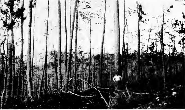
A Southern forest. One of our men estimated the timber on this tract.

These plans and other records may be kept up-to-date, with little yearly expense, additions of information being made by the regular field force of the concern, so that the initial expense of preparation is the only one necessary to consider. In this way the manager is able at any time to furnish himself or his directors with a birdseye view of the holdings and operations, and is able to look for years in advance on the location and result of cuttings. Directors are able intelligently to apprehend what is being done, and the manager intelligently to explain it.