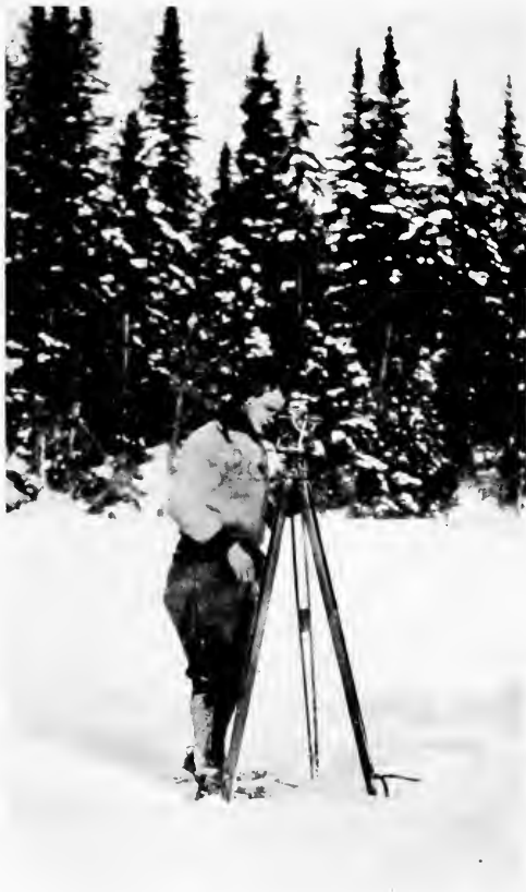
Light mountain transit used for traverse work.

Sample acres are measured throughout the tract, and the trees within these acres measured as in obtaining a present estimate. This work may be done in the same manner as in estimating, but smaller diameters will be taken into account than if the estimate is being made for present growth only. Even the seedlings will be counted on a few acres. A record will also be