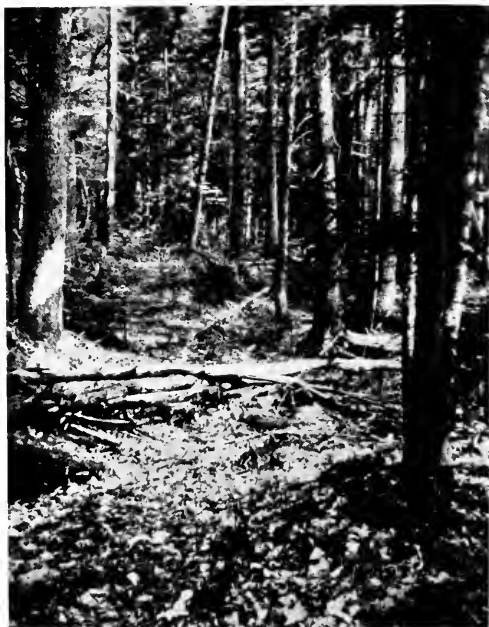
Thrifty spruce growth. Land like this should be a source of perpetual income. Note the vigorous reproduction.

The land owner, unless interested in cutting operations also, is chiefly concerned in his property from the standpoint of an