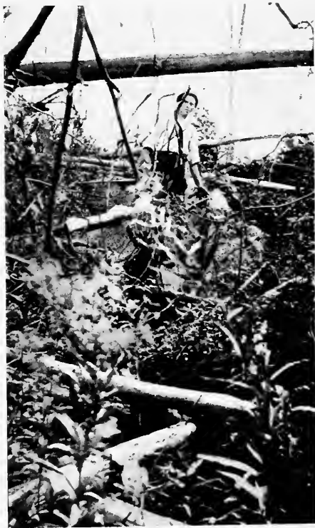
Heavy Burn in Northern Forest.

It is a far cry from the explorer of fifty years ago measuring his lumber visually from a mountain tree top to the trained man of the present day measuring individual trees with calipers. The change which has brought about this contrast in measuring forest values has brought many new standards and methods, and will continue to evolve towards the maximum of intelligent effort in forestry.