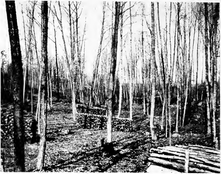
A heavy improvement cutting

Record of interior details for mapping is had. Trees, the kind, diameter, and number per acre. The slope of the land. The rock and soil characteristics. The species reproducing. The quality and condition of the growth. The merchantable condition of the tree-crop. Logging chances and conditions.