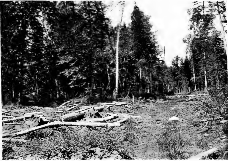
Efficient management avoids this kind of waste.

once definitely known afford a basis for all future decisions, and make unnecessary the continual consideration and reconsideration of the essentials involved. The owner or manager has at his command accurate plans showing growth and topography; a report giving present and perhaps future yields in timber; and definite plans for efficient handling. He also has complete survey records by which his acreage is known, and on which he can execute definite deeds in case of partial or total sale. Moreover, his land is marked to correspond with his records.