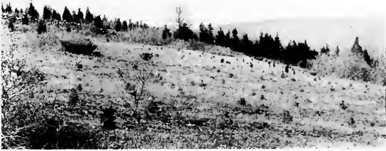
An experiment in white pine planting.

intelligently and economically carry on the policies best suited to the case.