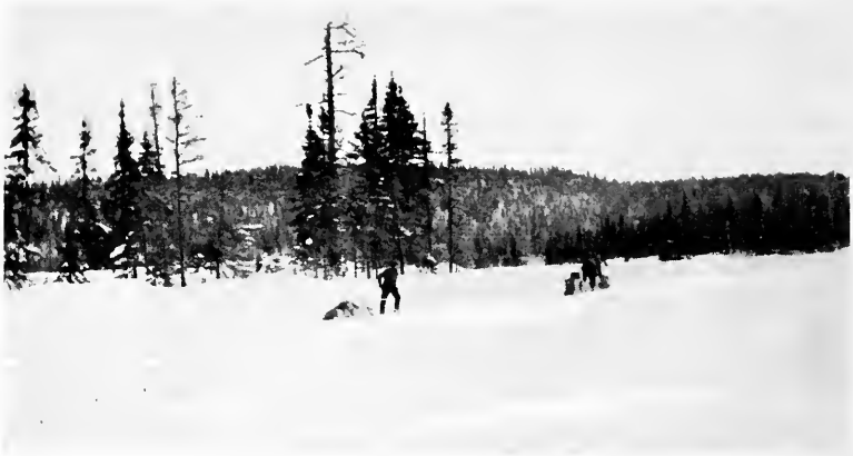
Moving camp in the North. It takes practical woodsmen to meet such conditions as these.

the maximum profits out of their operations, and yet who fall short in both instances through lack of knowledge of what truly constitutes efficiency.