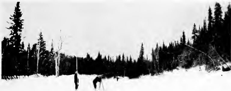
Running levels to control barometric work.

kept of what trees will probably die out through crowding and shading.