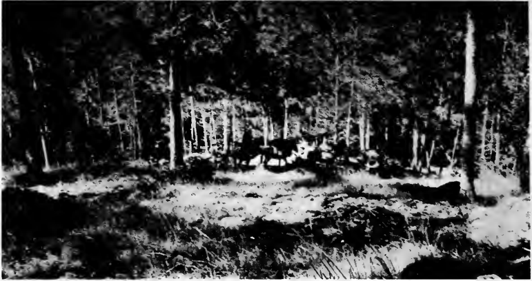
Moving camp in the South. It requires experience to cope with the widely varied conditions we are called upon to meet.

With the diameter limit idea came also the rules for economy in cutting: low stumps, small tops, sparing of the smaller individuals of valuable species when making bridges, skidways and camps; careful scaling, clean picking up on penalty of payment for cut lumber left. Even without technical aid there has been this tendency among thoughtful owners and operators to develop and conserve the forests along lines in which scientific forestry effects its greatest results.