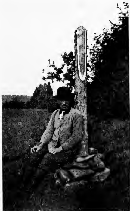
The bark would not strip from this dry cedar post.