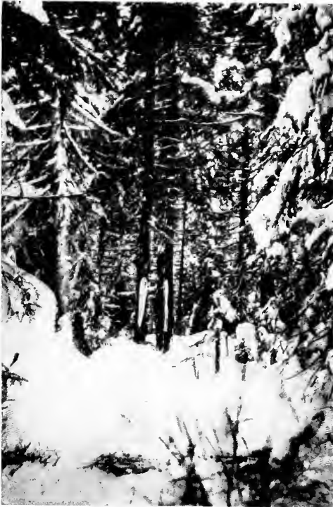
Spotted line in a Canadian forest. Note the heavy, well-defined spots.

As the exploration party travels it also takes a record of the diameters and kinds of trees, by measuring with calipers those on specified areas. For instance, a strip 66 feet wide is measured right along the line of progress; or measured acres, half-acres, or quarter-acres are taken at regular intervals along the party route. Where