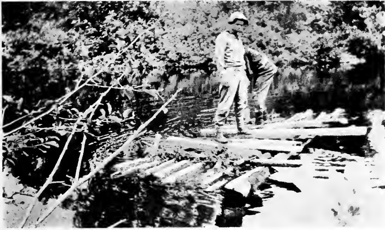
No nails or rope in this raft.

The instruments used in wood surveying are usually the magnetic compass and the Gunter's chain. Transit lines are sometimes run, and the solar compass is sometimes employed, but the element of cost must be considered, and the ordinary compass is recommended as being accurate enough for all practical purposes. An error of one rod to a mile, 1:320, is considered allowable in forest surveys. The compass is the only instrument with which lines can be run in the woods at a reasonable rate.