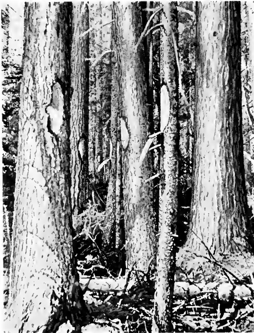
A spotted line through old growth.

The management of lands is greatly simplified by applied forestry. The facts