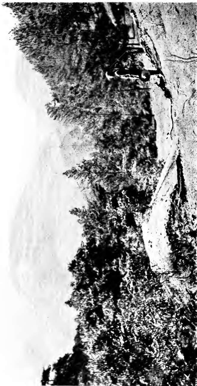
Unexplored land on a West Indian island