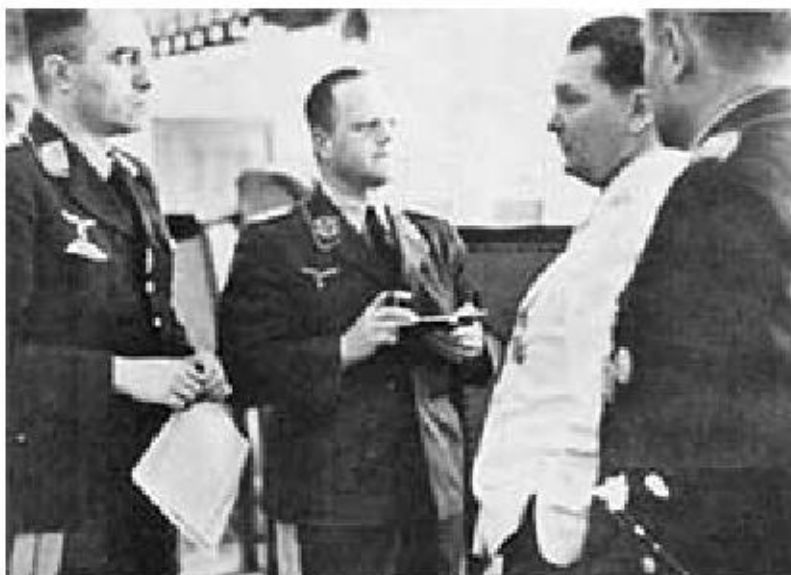
Milch (seen above with Göring and his chief of intelligence, Colonel 'Beppo' Schmid) took notes on everything.

vasion; this would take the pressure off Germany. And the bombing of London alone might bring about the final collapse. 'If eight million people go mad, it might very well turn into a catastrophe! If we get the fine weather, and we can eliminate the enemy's air force, then even a small invasion might go a long way.' Therefore he was against cancelling invasion preparations altogether. 'The cancellation would come to the ears of the enemy and would strengthen his resolve.' 30