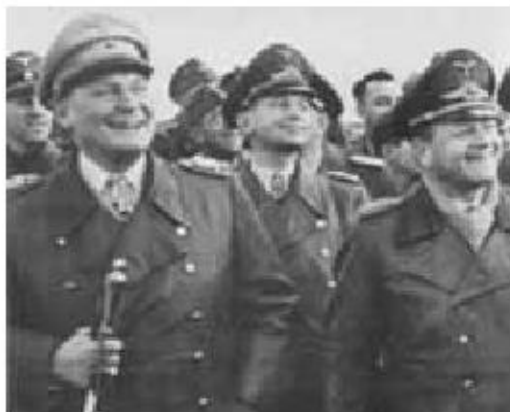
Earlier, Göring, Milch and the Chief of Air Staff Hans Jeschonnek (center) appeared the best of friends in public. But after the RAF firestorm raids began with a grisly series of attacks on the city of Hamburg in July 1943, Jeschonnek put a bullet in his head at Luftwaffe headquarters.

The new Chief of Air Staff was Colonel-General Günter Korten, commander of the First Air Force, who had been Milch's staff officer until October 1936. Milch thought very highly of him. 'While the newcomer Korten soon learned how to gain Hitler's confidence, his relations with Göring became very strained,' he wrote. 'Korten, in his diplomatic way, prevented things from coming to a head for a long time. At the end of June 1944, however, he confided to me, as his former chief, that by August 1944 at the latest he wanted to resign the post as with the best will in the world he could not get on with Göring.' 34 Before that month came, however, Korten had also met a violent end.