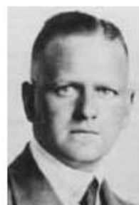
Erhard Milch before 1914.

Their first battle station was on the River Deime. On the third day a Russian attack began against their lines and Milch's battery fired nine hundred rounds. How often in peacetime he had doubted whether one could entirely suppress the coward within oneself; he was very pleased with his own composure now the test had come. On the morning of 3 September 1914 a six-hour