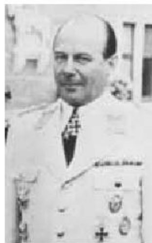
Udet, the Bohemian caricaturist and former stunt pilot, alternately idolized and mistrusted Milch.

The first target Milch set was to double production of war aircraft — an increase of 1,200 — by the late spring of 1942. The three bottlenecks — aero-engine production, manpower and aluminium supplies — would each be settled in a different way. A plant with a capacity of a thousand engines a month was under construction; its completion would be brought forward by one month to four months. Speer was building three aircraft assembly factories. To meet the huge labour requirements — assessed by Udet at a minimum of 3,500,000 new workers to add to the existing 1,300,000 in air armament — Hitler ordered the immediate disbandment of three divisions in the east as one contribution, while the bulk of the rest were 'to be withdrawn from army production'. To curb the growing problems of absentees ( Bummelanten ), Milch announced, 'I have reached agreement with the Reichsführer SS Himmler, that anybody who changes jobs more than three times a year is to be drafted to a forced labour battalion; and anybody who refuses to work even there will be shot.'