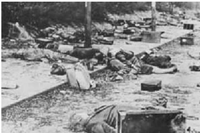
The results of the RAF attack on Hamburg in July 1943. This was what caused Milch to demand priority for Reich defence.

the gun-laying and fighter control Würzburg radar sets which Martini had feared all along. 3 While the searchlights wandered aimlessly over Hamburg's sky, and the blinded night-fighter aircraft fumbled in the darkness, fifteen hundred civilians were killed and much of the city devastated. Only twelve bombers were shot down. The Luftwaffe's ignominy was complete, for no counter-measure had been developed against the dreaded foil strips.