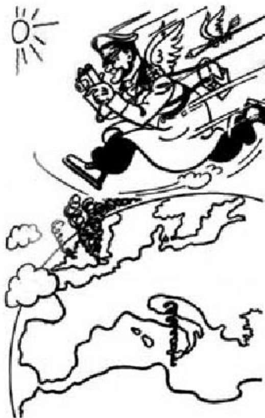
Milch photographing battlefield hotspots in 1940. (SKETCH BY ERNST UDET)

It was Hermann Göring who persuaded the Führer to concentrate his army on other more immediate tasks than the capture of Dunkirk. 1 He saw it as an opportunity of scoring over the army and emphasizing the Luftwaffe's prowess; after the war one of his adjutants was to state, 'He used to look down on the army as a pitiful, obsolete branch of the armed forces.' 2 On 23 May Göring telephoned to Hitler his view that the Luftwaffe's 'finest hour' was at hand; single-handed it would destroy the British forces in France. 3 Against fu-