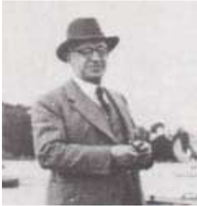
BROTHERTON LIBRARY, UNIVERSITY OF LEEDS