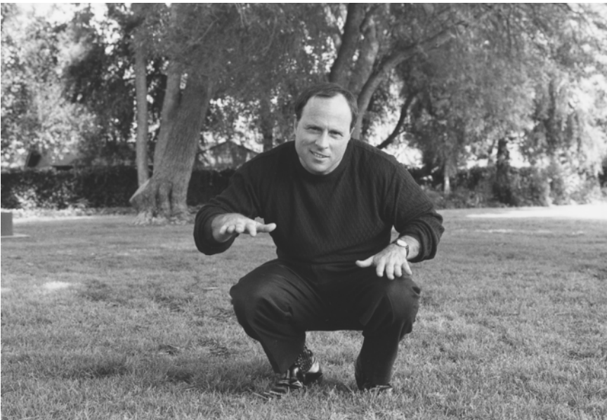
Crouch down to start the backing up "come" game.

It is also important that your dog learns to be comfortable when you reach out and grasp her collar when she gets to you. Make this easy and nonthreatening. Don't lunge at the dog and grab the collar. Instead, gently grasp it as you're petting, praising and treating. This is important, because it is inevitable that at some point in your dog's life you will need to grab hold of her collar. Usually it's to stop her from running or walking into a dangerous situation. If you condition your dog to associate positive things with you grabbing her collar, you will be far less likely to wind up with a dog who bolts when you reach for her. Remember to add this to the end of each come game repetition.