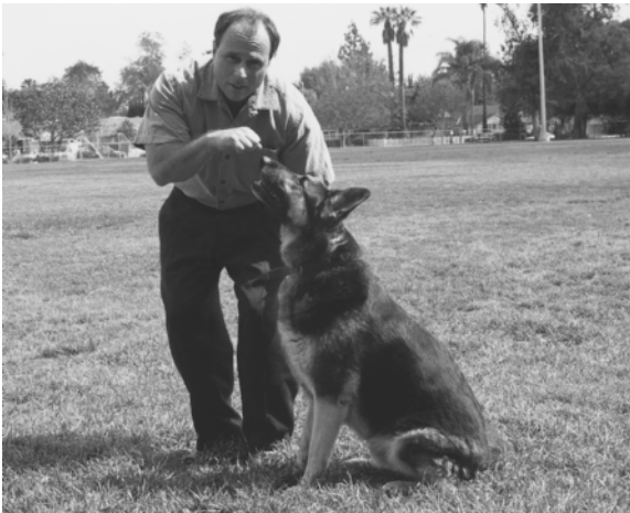
I am standing to the side, but my hand is still directly in front of the dog's face.