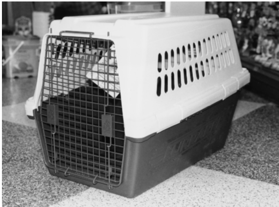
A typical crate. It should be large enough for your dog to lie down and be comfortable.

The basic scenario for housebreaking goes like this: Confine your dog. After a few hours, take the dog from the crate to the location you want him to eliminate in. Remember to take the dog out the same door to the same location every time you want him to eliminate. Wait 10 minutes for him to do so. If he goes within the 10 minutes, praise, reward (a small treat) and wait an extra two or three minutes to make