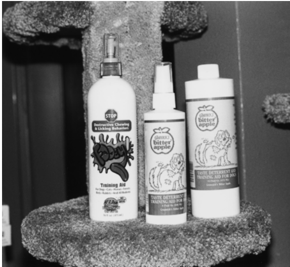
Bitter Apple and Fooey are two examples of products that can be used to address nipping and chewing challenges.

A little planning will go a long way if you're using this method. Most owners have an idea of when their dogs will nip—common times include when you come home after work, when you sit down on the couch to watch TV at night or when you go out in the backyard. If you can identify scenarios in which nipping is likely to occur, you can more easily and consistently spray your hands and feet before the nipping happens. It is also important to keep the spray accessible whenever you are interacting with your dog, so it can be applied quickly, if needed.