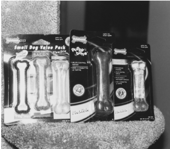
Nylabone makes excellent chew bones in many shapes, sizes and flavors.