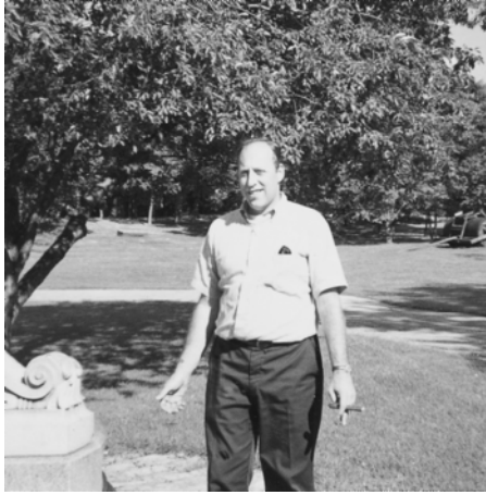
Dad at 35.

trainer, and the trainer, perhaps thinking this dog was going to bite him, completely lifted the animal off the ground and held him dangling in the air. The dog's barks became strangled yelps, and after 10 or 15 seconds of struggling, the dog just kind of went limp. The trainer then put the dog back on the ground, snapped the leash once more for good measure and handed the leash back to his owner. The dog just kind of stood there, still conscious but clearly dazed. I vividly remember wishing I were old enough and strong enough to put the trainer on a leash and collar and treat him exactly the same way. Great lessons for a kid to learn, huh?