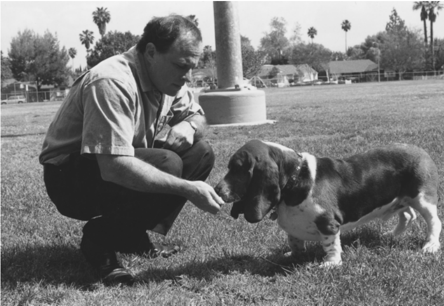
First, I get Buford’s attention.

Once the dog has learned “good,” you can start teaching her to sit. The best way to do this is to lure the dog with your baited hand. This means you put a small piece of food in your hand and make a fist. Hold your fist directly in front of the dog’s nose. Let her sniff it, and then slowly bring your hand over the top of the dog’s muzzle and head, and moving on down the center of the dog’s back. Keep your hand no more than three to four inches from the dog, especially when it’s by her muzzle and head. Most dogs will lift their head in an attempt to follow your hand. As your hand moves out of sight they will continue to look backward, and as they shift their body in the direction your hand is moving, they will sit.