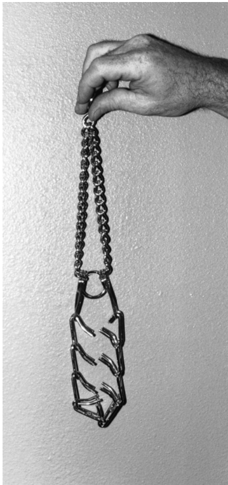
A pinch collar.

Prong collars, sometimes called pinch collars, were once also routinely used. These devices work in a similar fashion to a choke chain, but the prongs pinch the dog's neck when the collar tightens. It sounds worse than it is, but it is clearly not a device designed to be pleasurable for your dog.