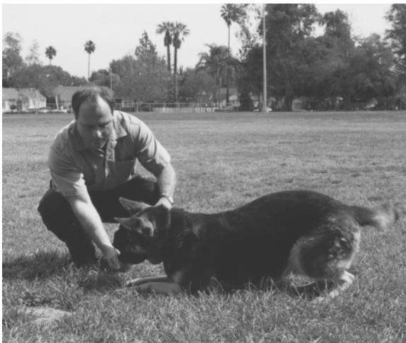
As I bring my hand to the ground, the dog follows my hand into the “down” position.