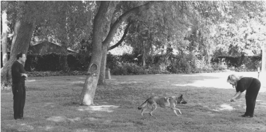
The group come game with two people.

Don't do this exercise for too long at one time, or the dog will become bored. It's always best to end a training session with your