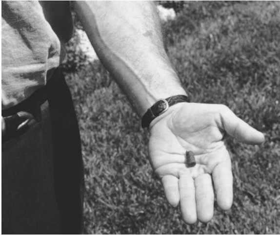
This is the right size food treat.

going to be doing a lot of repetitions and you don't want your dog to gain weight as a result of training, nor do you want to spoil her appetite for her nutritious main meals. Second, small treats are less distracting. The objective is to avoid making the focus of a training exercise the treats. The perfect food treat gives the dog a quick, tantalizing taste of something yummy. It is not something the dog needs 30 seconds to eat.