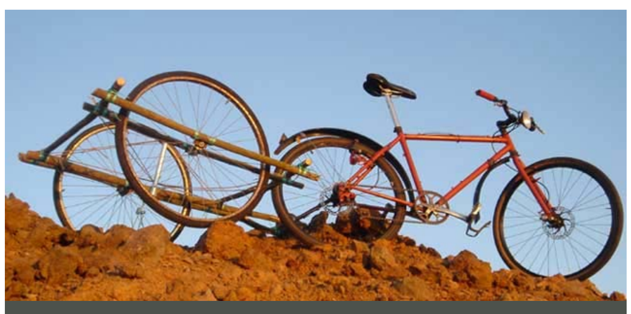
Carry Freedom gets their graphics done by done by Do Good Advertising

<u>Aaron's $30 brazed conduit utility trailer</u> This is the man who got the bamboo bicycle trailer rolling