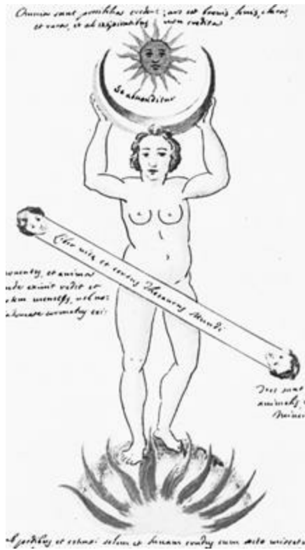
Leaf 4 | The panel across the body reads, “The Book of life and true Treasury of the World.”