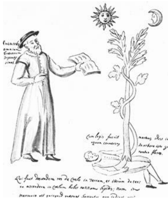
Leaf 18 | The tree surmounted by the Sun and Moon is accompanied by the words: “When the Stone is dead, that is changed to water, in this tree it will produce flowers.” Beneath Aristotle and the prostrate human figure is a quotation from the Emerald Tablet: “He who makes everything descend from heaven to earth, and then ascend from earth to heaven, has information about the Stone.”