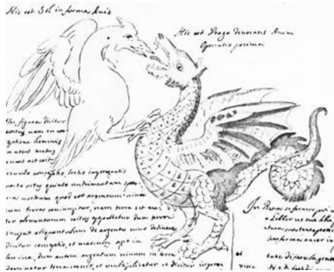
Leaf 5 | The first operation: the Solar-Bird battles with the Earth-Serpent, who, tearing out its own entrails, gives them to the bird.