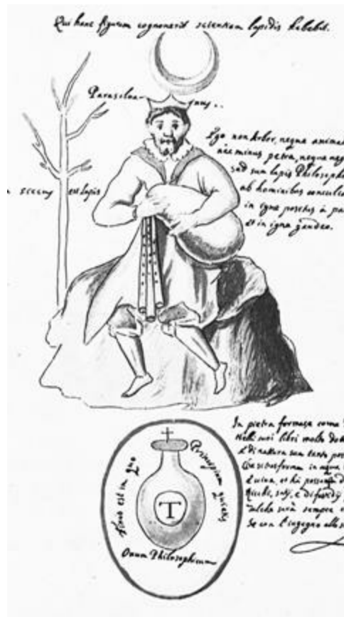
Leaf 19 | To the right of the seated man: “I am neither tree nor animal, nor stone nor vegetable, but the Philosopher’s Stone, trampled on by men, cast into the fire by my father, and in fire I rejoice.” Below the man is the Philosophic Egg containing the words: “It is the end in which the beginning resets.” The capital ‘T’ stands for ‘Tincture.’