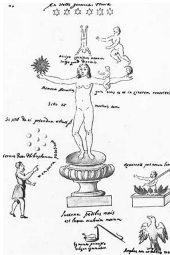
Leaf 20 | At the top is written: "Rains are made by six stars." The two sentences about the figure read: "Remember Mercury, for ashes thou art and unto ashes thou shalt return. I thirst and am dead." Above the seven globes at the left is the admonition: "If he thirst, give him a drink and he shall live."