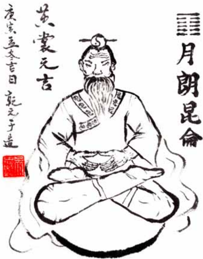
Figure 11. Awakening Your Inner Wisdom Posture