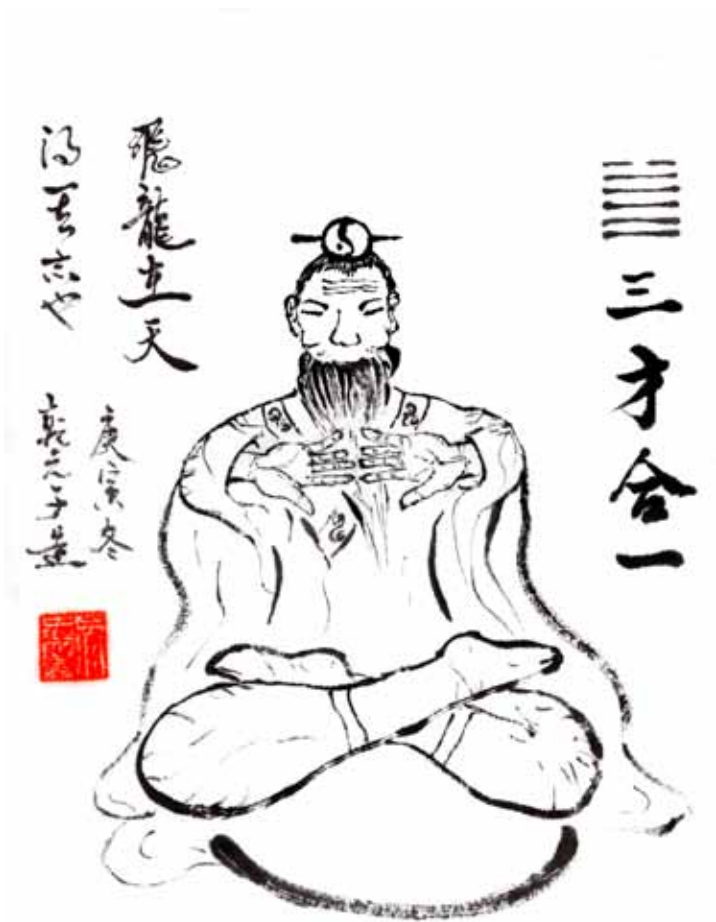
Figure 5. Merging with the Universe Posture