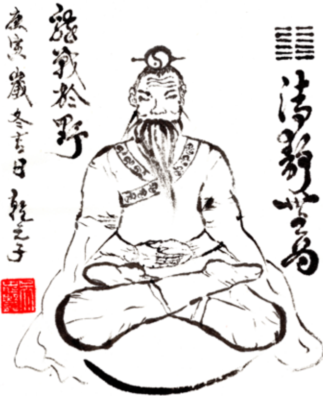
Figure 12. Enjoying the Action-less Posture