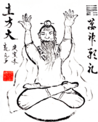
Figure 8 (page 73)