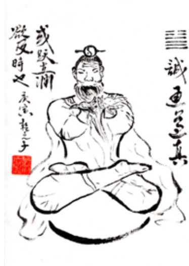
Figure 4 (page 49)