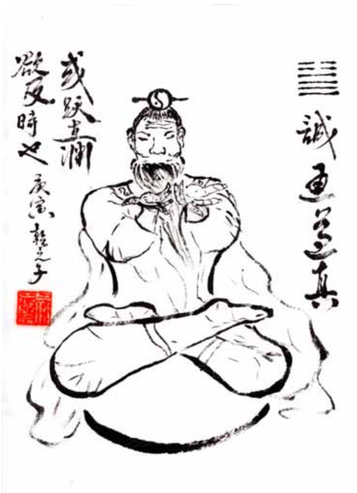
Figure 4. Resonating with the Dao Posture