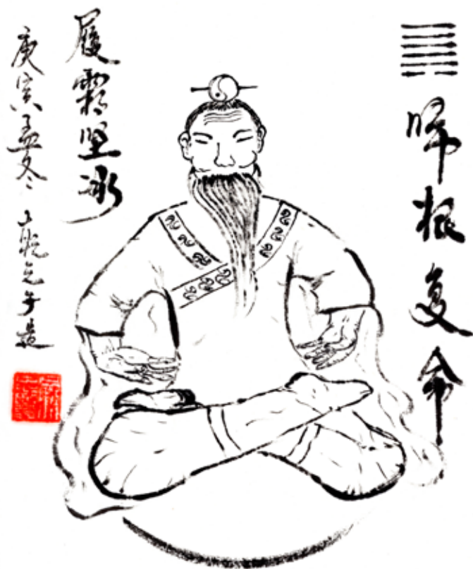
Figure 7. Returning to Your Root Posture