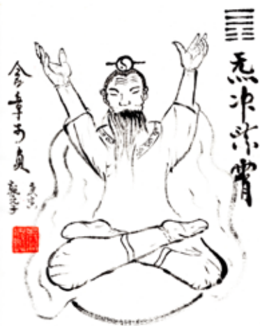
Figure 9 (page 81)