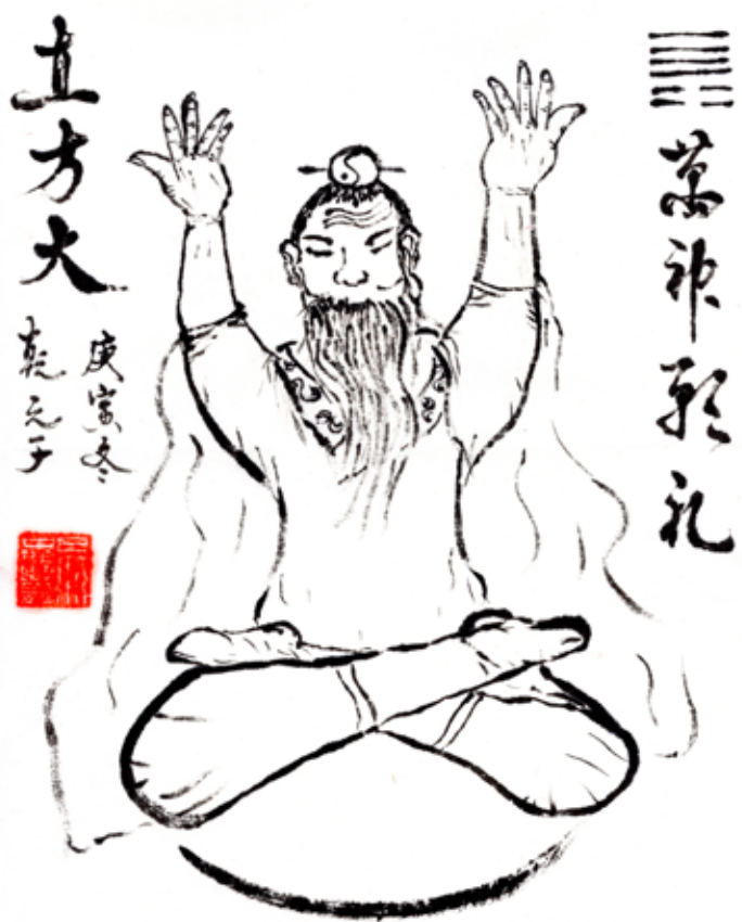
Figure 8. Cultivating Your Gratitude Posture