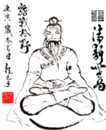
Figure 12 (page 101)