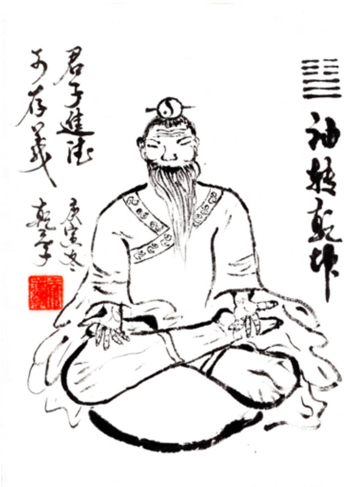
Figure 3. Communicating with the Heavens Posture