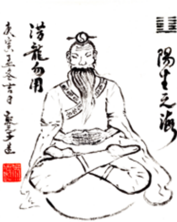
Figure 1 (page 25)

Please refer to the pages referenced in parenthesis for full information about the movement.