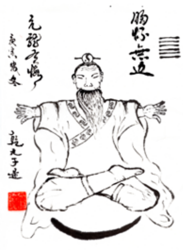
Figure 6 (page 61)