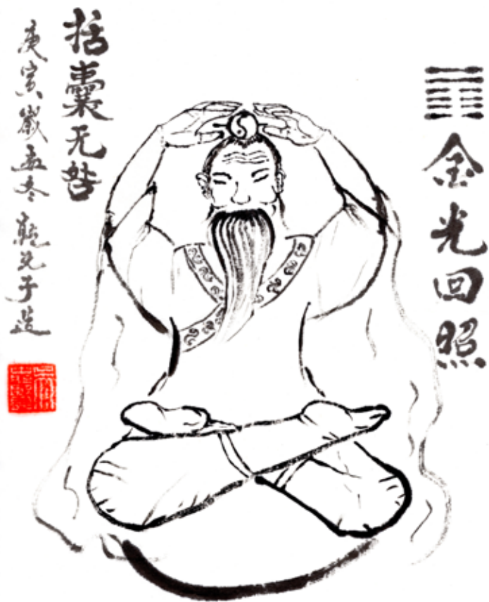
Figure 10. Brightening Your Body Posture