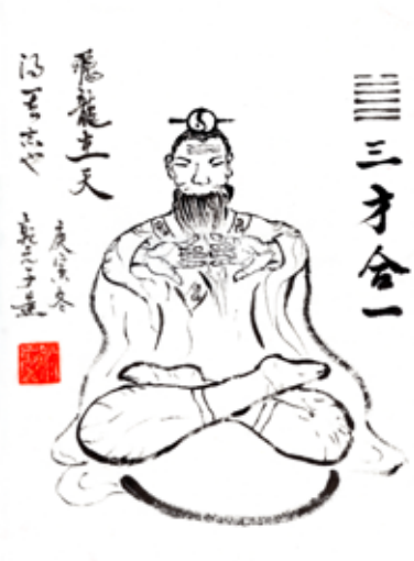
Figure 5 (page 55)