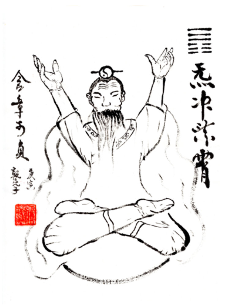
Figure 9. Uplifting Your Spirits Posture