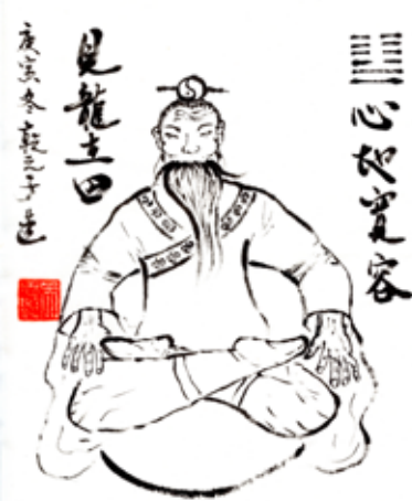
Figure 2 (page 35)