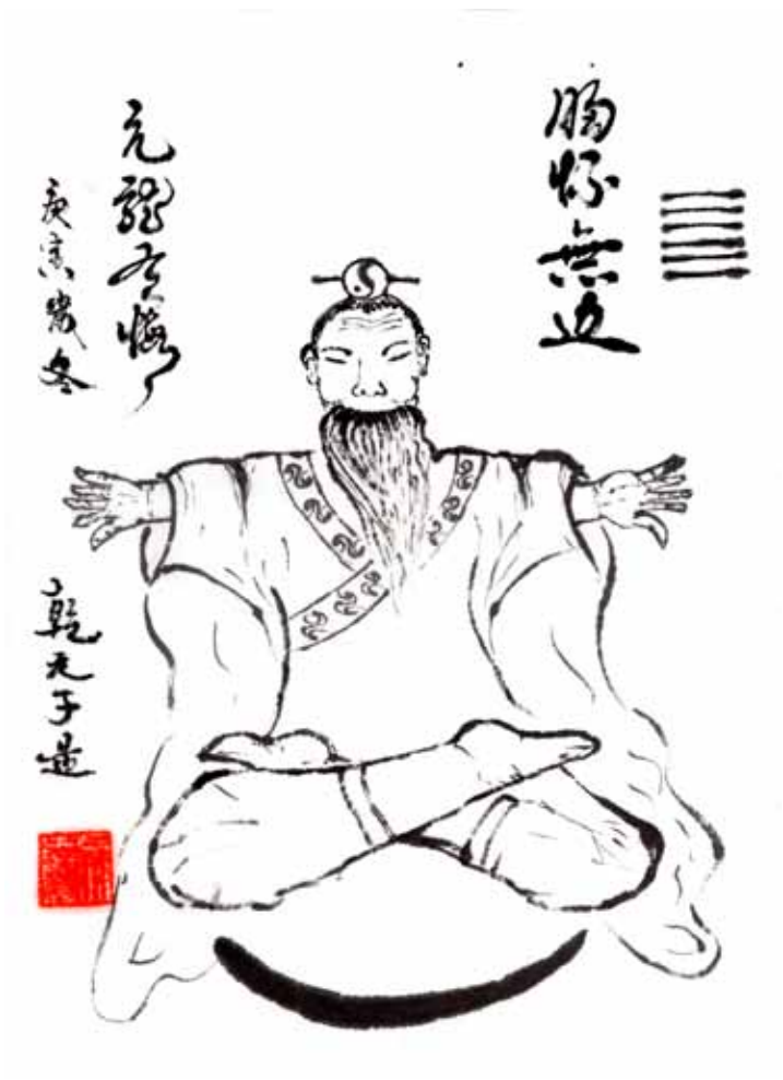
Figure 6. Embracing Infinity Posture