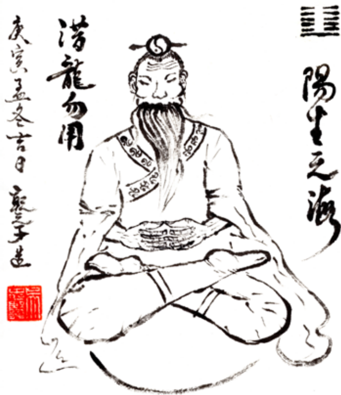
Figure 1. Generating Your Vitality Posture