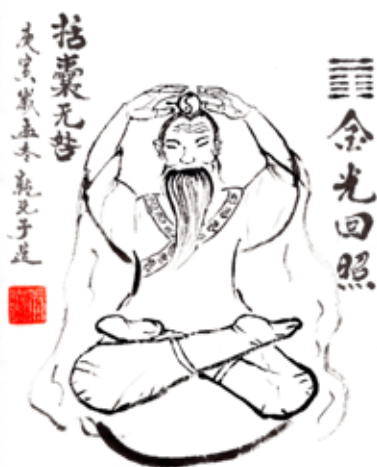
Figure 10 (page 89)