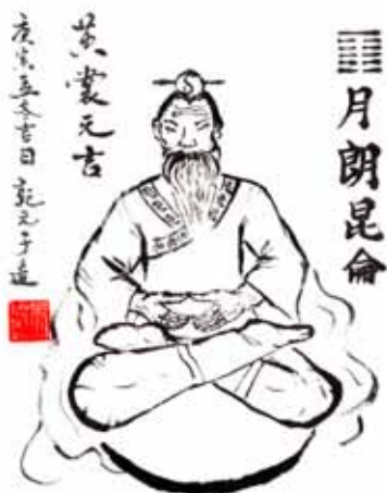
Figure 11 (page 95)