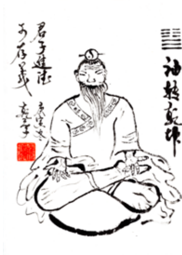
Figure 3 (page 41)